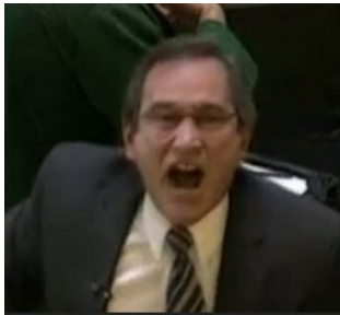
FB Image Santelli 2009 and hate.

On February 19, 2009, Rick Santelli made his famous rant which gave birth to the "Tea Party Movement," which was one of two movements in the living memory of the American people. The other movement was the "Civil Rights Movement." While it was the right cause at the right time, the Communists used it to further their agenda and the Communists exploit this great movement to this day with their projection of racism