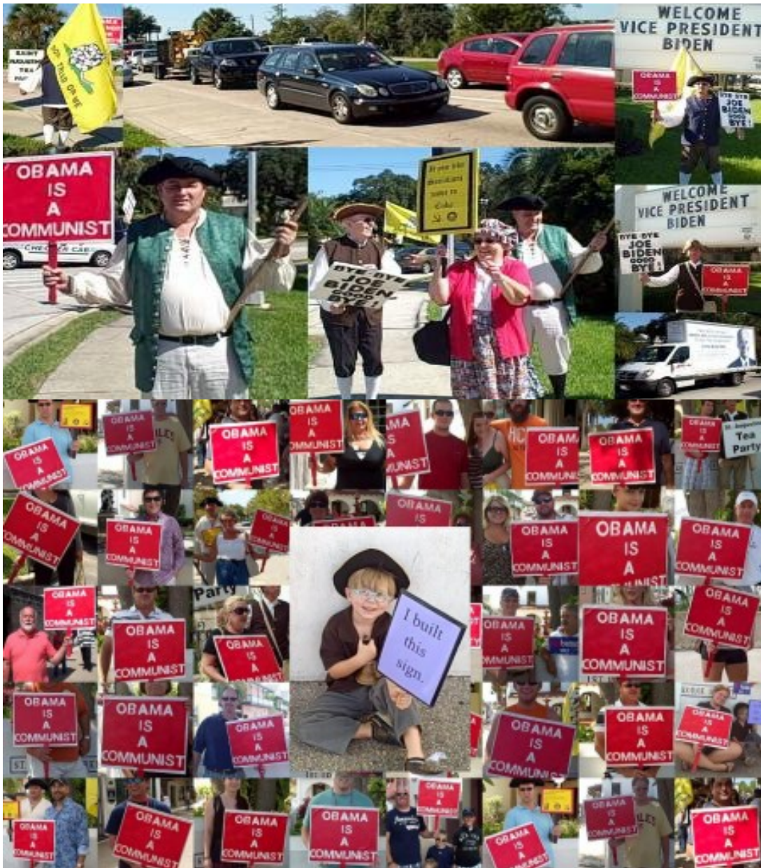
TCCR Staff Photos 10-20-2012

Like our Facebook Page https://www.facebook.com/towncrier2010/